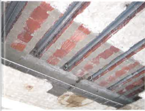
▼ Completed restoration of the Potter County Courthouse.