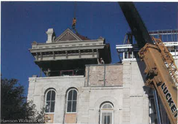
▼ Erection of one of the four corner turrets.