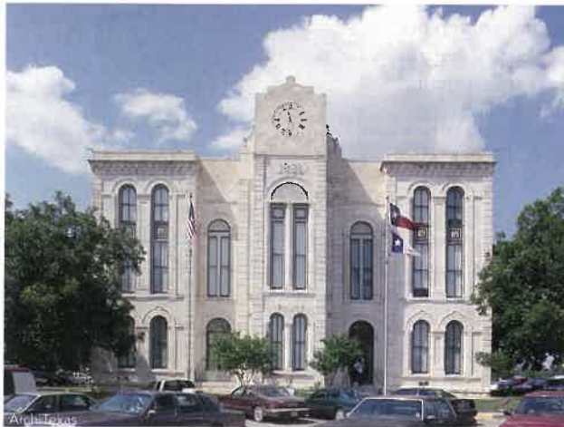
▲ The Bosque County Courthouse, prior to restoration.