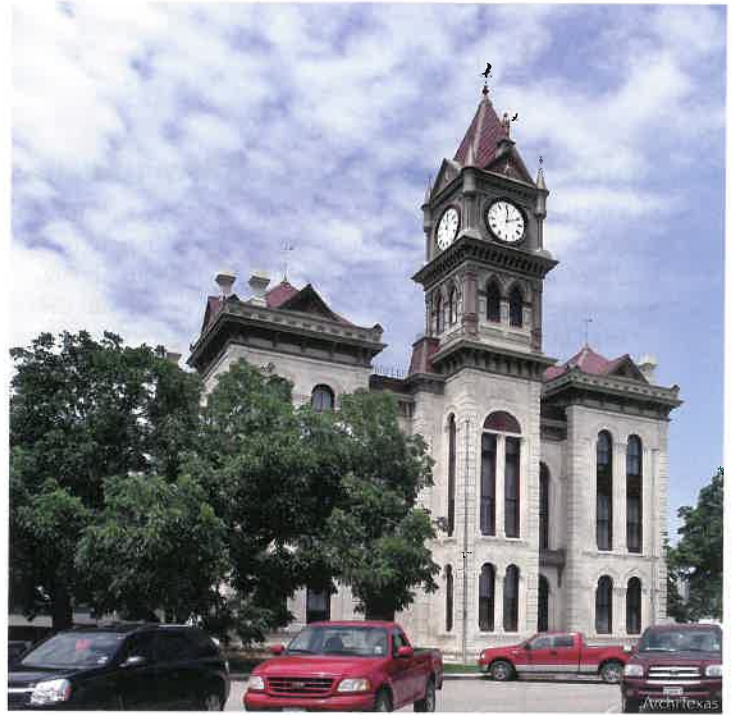
▲ Completed restoration of the courthouse.