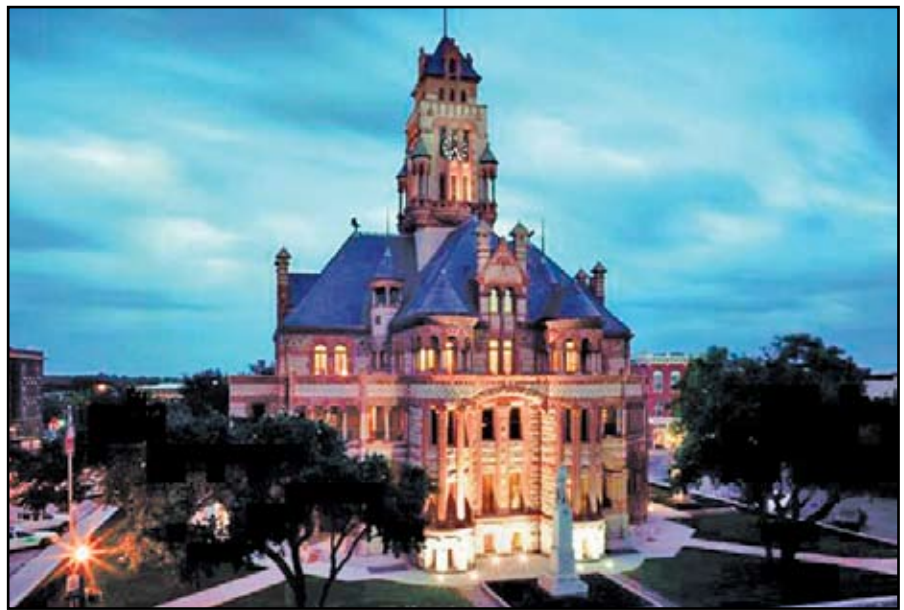
Dramatic illuminated view at dusk of the Ellis County Courthouse

For example, moisture in the brick masonry at the core of the building led to the gradual deterioration of the building’s lime-based mortar. In many areas of the basement, the mortar had deteriorated so much that brick was entirely unsupported and could be lifted from the wall by hand.