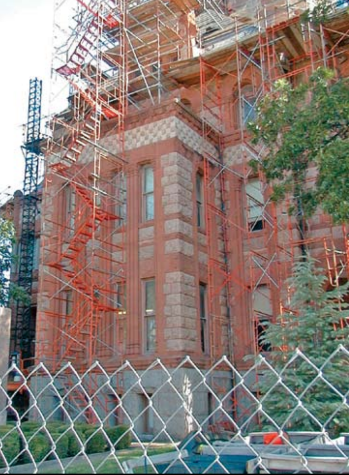
Exterior south stairs scaffolding, Ellis County Courthouse

To restore the balcony, the previously-added floor system was removed and evidence of the original structural system that supported the balcony exposed. Remnants of the balcony existed in the form of embedded steel C-channels in the perimeter walls and patches in the wood flooring where intermediate supporting columns once existed.