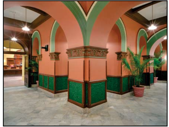
Small interior hallway

These code-required installations were carefully designed to have minimal impact on the historic appearance. In cases where new elements were entirely visible, the elements were designed to be as visually unobtrusive as possible. For example, building codes required the installation of a new elevator and fire exit stair.